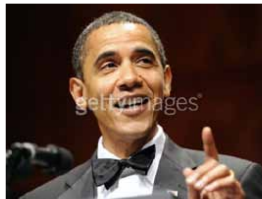
President Barack Obama 65th Annual Radio & Television Correspondents Association Dinner

On October 10th, President Obama delivered the keynote address at the 13th Annual Human Rights Campaign Dinner held at the Center. The Human Rights Campaign is the nation’s largest lesbian, gay, bisexual and transgender civil rights organization that champions the